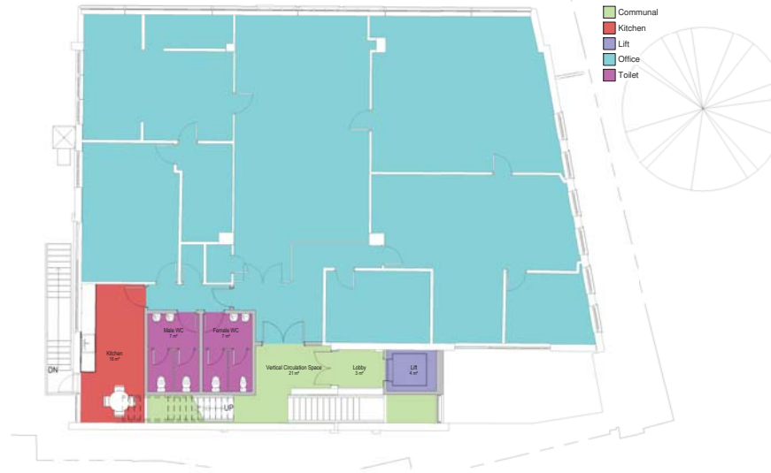
2 First Floor - Proposed 1 : 100