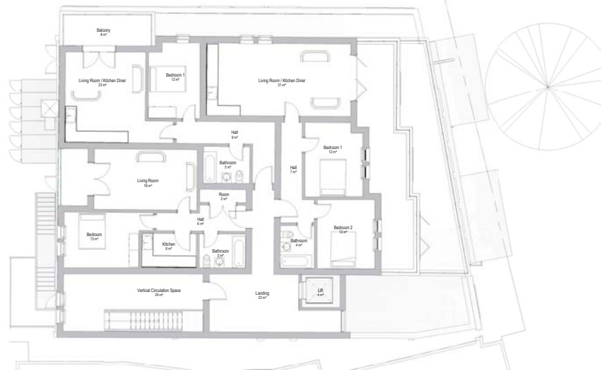
4 Third Floor - Proposed 1 : 100