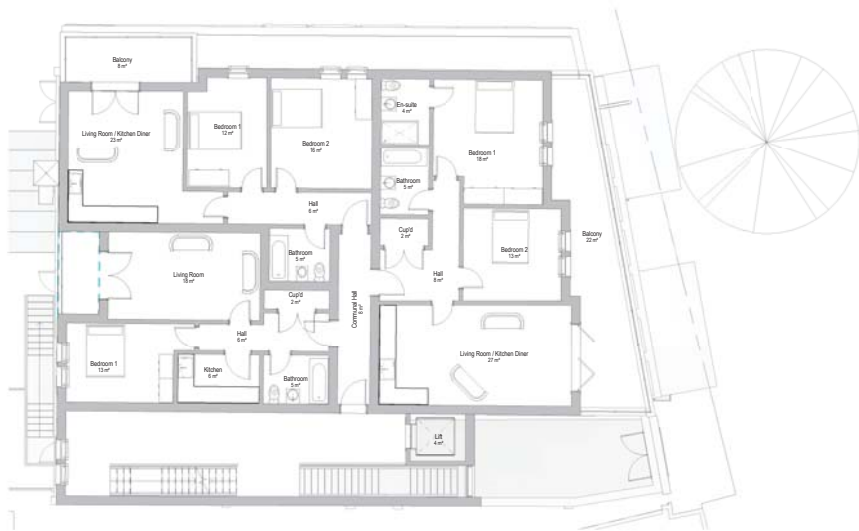
3 Second Floor - Proposed 1 : 100